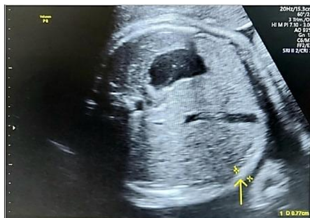
Figure 1: FASTT measurement (indicated by arrow)

thickness (FASTT) was measured in millimeters at anterior third of abdominal circumference by placing the cursor at outer and inner edges of the echogenic subcutaneous fat line as shown in Figure 1. The measurements were repeated every week and the last measurement before delivery was taken into consideration for analysis.