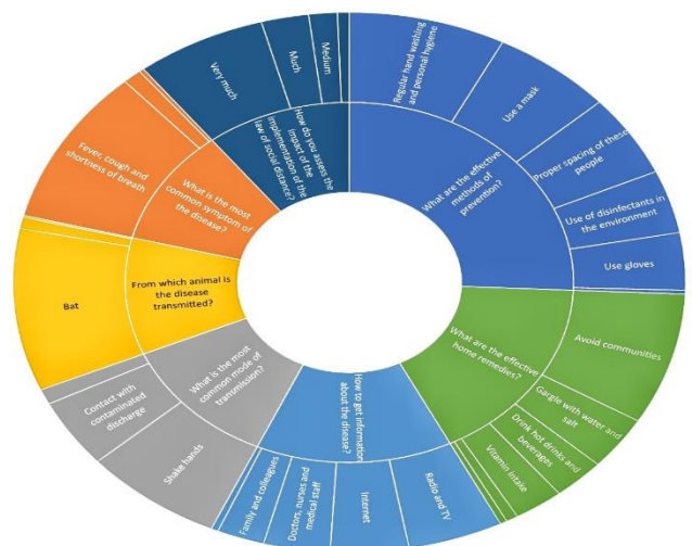
Figure 1: Sunburst chart of answers to questions of level of knowledge

Thirty-two patients (33.33%) had the lower motivation to continue treatment during COVID -19 pandemic. Fear of fetal transmission (28.13%) was the most common reason for decreased motivation to continue treatment (P-value = 0.011).